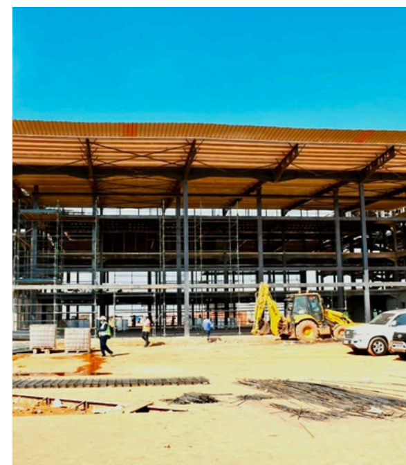
NEW KASUMBALESA BORDER INFRASTRUCTURE TO EASE TRADE, TRUCK CONGESTION - ZRA